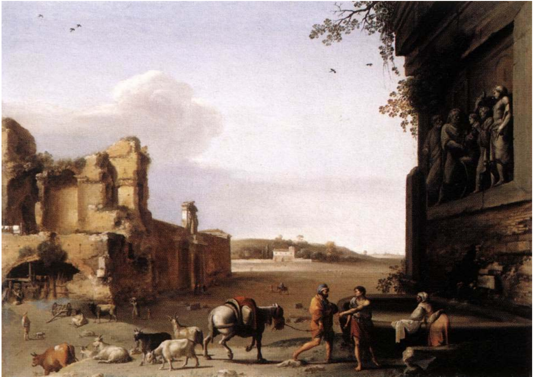
Cornelis van Poelenburg, Ruins of Ancient Rome , 1608, Louvre