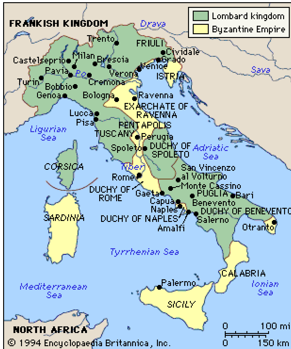
Italy ca. 700