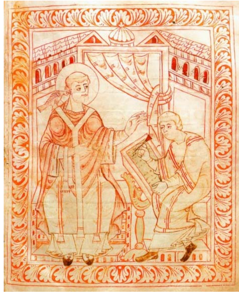
L: Throne of Gregory the Great; R: Gregory dictating, manuscript illumination, ca. 1000