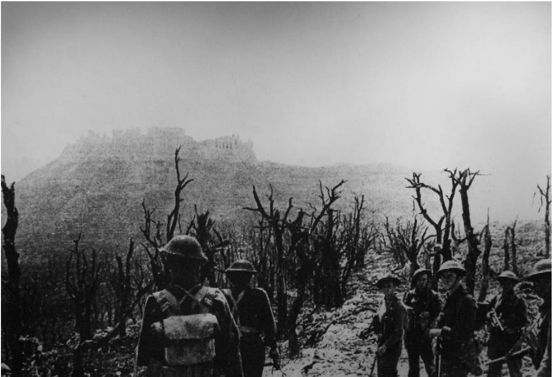
Monte Cassino after US bombardment, 1944