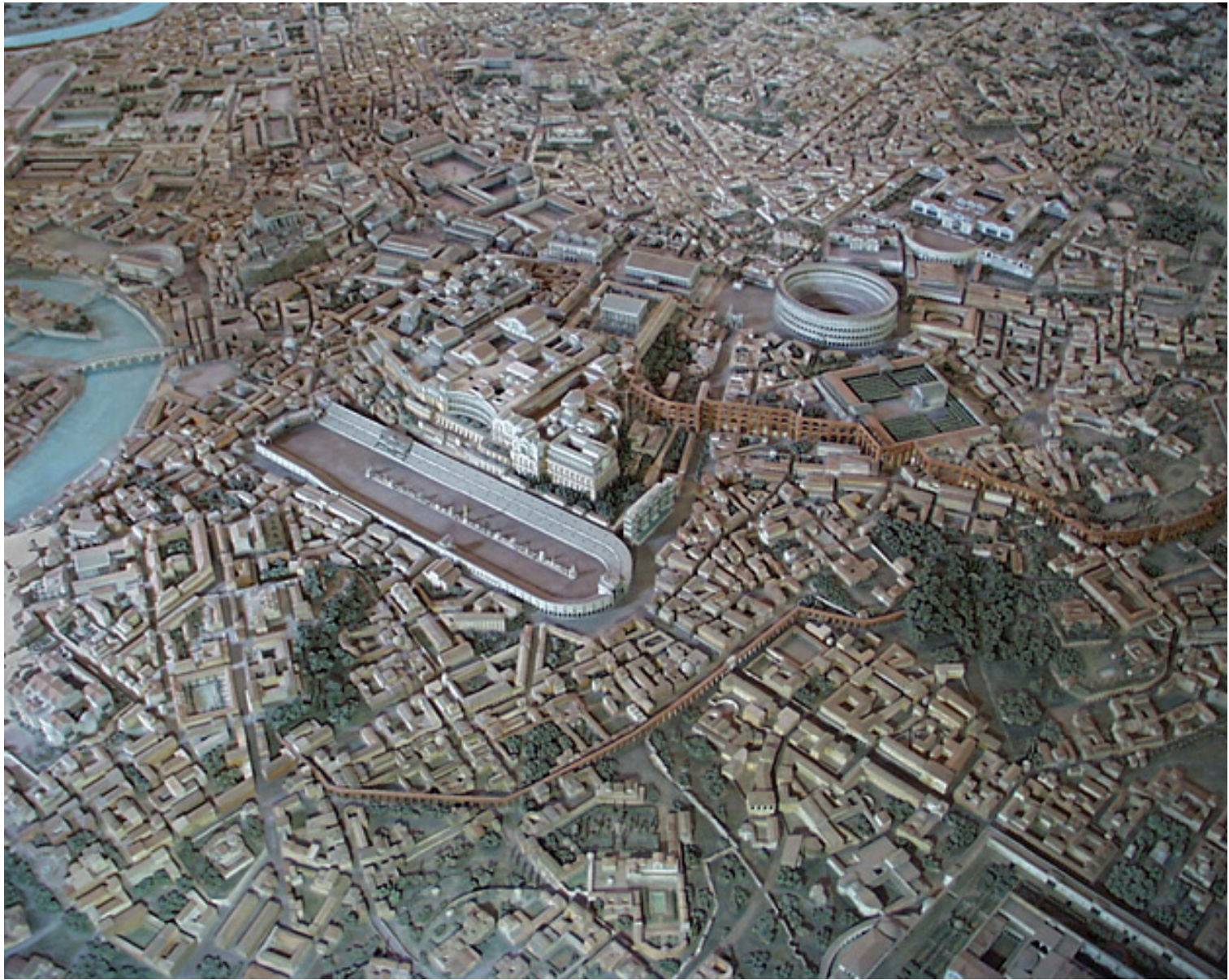
Aerial view of ancient Rome, ca. 350 AD (“Il Plastico”)